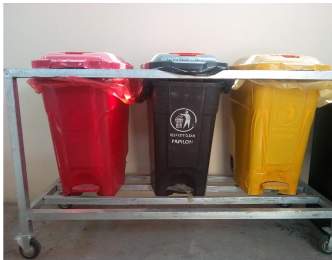
Plate 2: Segregation of medical waste using the proper color coding.

Collection of medical waste: Table 4 below indicates the various methods utilized for collection and transportation of medical wastes from the point of generation to on-site storage by the surveyed hospitals. Majority (46.25%) indicated that plastic bins are used for the on-site transportation of waste, 37.5% and 12.5% use combination of trolleys and plastic and wheel barrows respectively similar to Lucy, (2017) assessment. While the remaining 3.75% use combination of plastic bins and wheel barrows for the on-site transportation of medical waste. However, collection frequency of collection was excellent across the surveyed locations as (90%) collected waste more than twice in a day. This finding is similar to Olukanni observations in Otta, Nigeria, where surveyed hospitals collect waste up to three times per day, in line with the standard practice (WHO 2002). For the off-site transportation of medical waste, 63.75% of the respondents indicated that the waste is been evacuated using constructed waste disposal trucks, 20% use trolleys while 16.25 use wheelbarrow are used for transportation of medical waste for final disposal. However, the use of wheel barrows for medical waste collection and transportation depicts some sort of deficits in facilities and other infrastructure for waste management in the hospitals which undoubtedly be related to lack of the funding of the hospitals towards management of medical waste for public health protection.